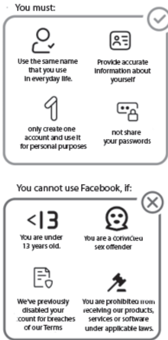
Figure 4. Icon cards present the user responsibilities

tation must serve the lawyers' needs and be accessible in the case of a dispute. The second presentation must clearly outline the essential rights and obligations of the service user and be integrated into the user interface.